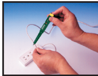
Checking for open wires in cables