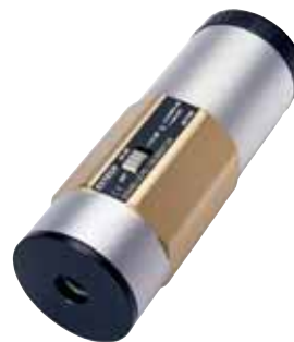
Optional Precision Calibrator 94dB/114dB fits 1/2" or 1" microphones - enables user to calibrate through the microphone