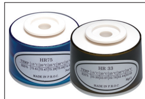
RH300-CAL Optional calibration salt bottles