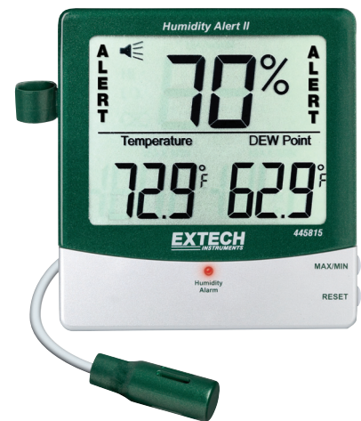
Model 445815 Humidity Alert II with external probe and storage for cable