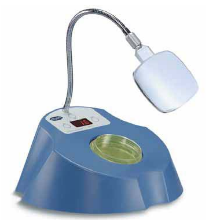
SC6 with SC6/1