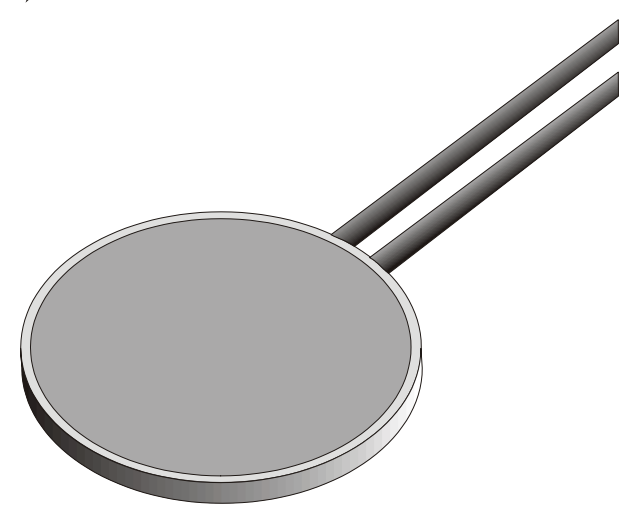
Figure 1 HFP01SC outlook